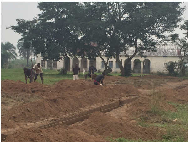
The foundation for the new primary school has begun!

But what truly defines a relationship? Someone at the United Methodist General Board of Discipleship recently polled his friends with this same question. He received responses such as, “Relationships are what you build with people, nature, and creation. It is not a mere attachment with the other but it is a connection you nurture and renew every day because it needs to grow. Just as a rose needs her gardener and the gardener cares for her rose, all must mutually grow and find beauty in the other.” And, “A relationship for me, means an interdependence based on trust between two or more parties.”