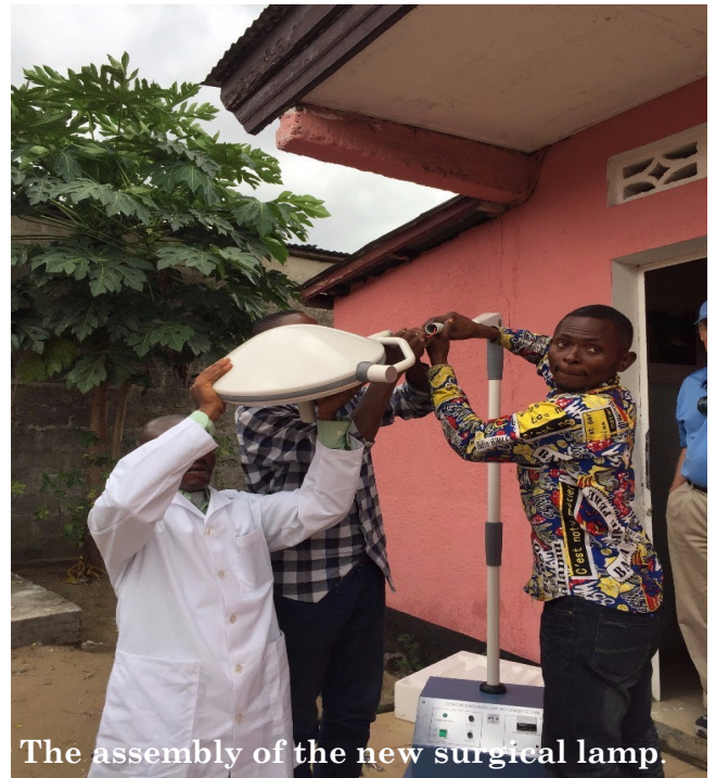
The assembly of the new surgical lamp.

We see blessings when we see the farm provide food for the hungry and starving and people learn to provide for themselves; When children, once skinny and malnourished, look healthy and happy because of the Partnership's nutrition programs at Miriam's Table & Mpasa. When a father, blind from cataracts, sees his wife and children for the first time in 10 years and sings Hallelujah.. Every day your gifts bring blessings.