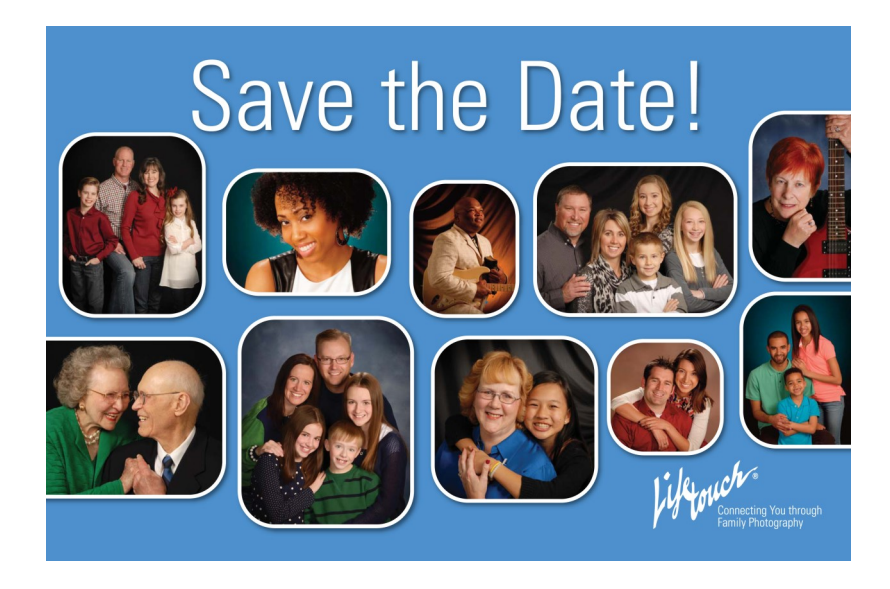
Photo Dates: May 11th, 12th, 13th, 16th, 17th, 25th, 26th and 27th

https://booknow-lifetouch.appointment-plus.com/9r52t450/