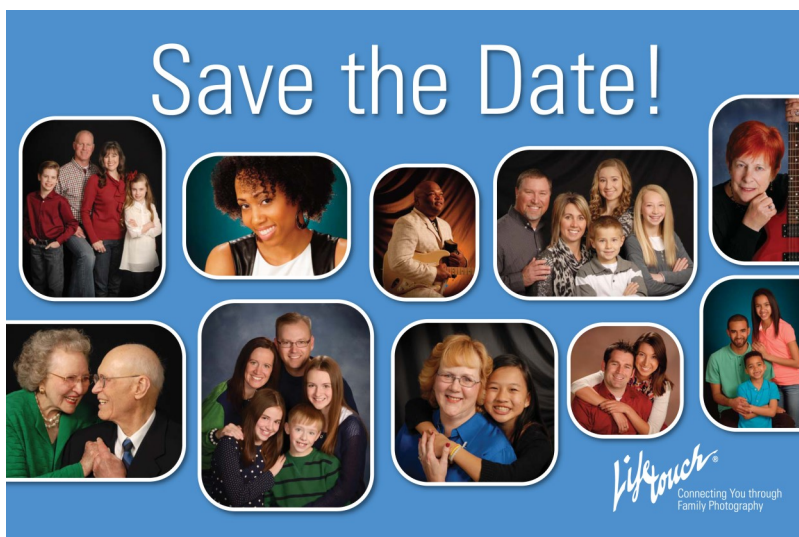
Photo Dates: May 11 th , 12 th , 13 th , 16 th , 17 th , 25 th , 26 th and 27 th

https://booknow-lifetouch.appointment-plus.com/9r52t450/