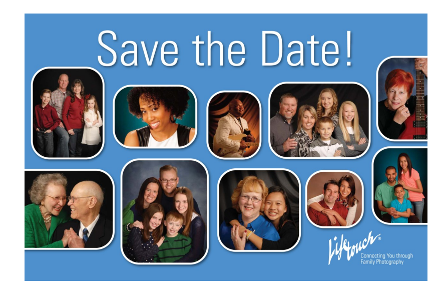
Photo Dates: May 11<sup>th</sup>, 12<sup>th</sup>, 13<sup>th</sup>, 16<sup>th</sup>, 17<sup>th</sup>, 25<sup>th</sup>, 26<sup>th</sup> and 27<sup>th</sup>

https://booknow-lifetouch.appointment-plus.com/9r52t450/