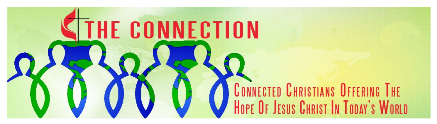
From the desk of our Conference Director.