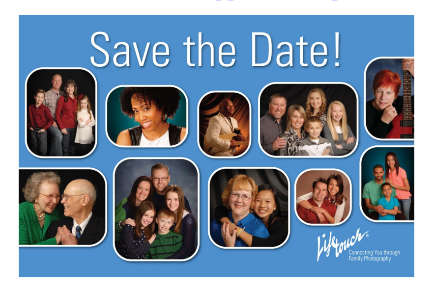
Photo Dates: May 11th, 12th, 13th, 16th, 17th, 25th, 26th and 27th

Click the link below to register for your spring photo session: <a href="https://booknow-lifetouch.appointment-plus.com/9r52t450/">https://booknow-lifetouch.appointment-plus.com/9r52t450/</a>