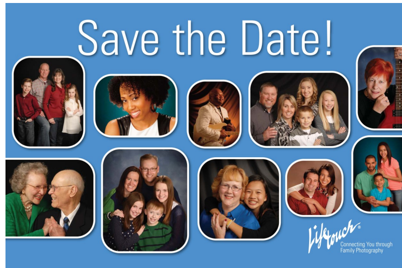
Photo Dates: May 11 th , 12 th , 13 th , 16 th , 17 th , 25 th , 26 th and 27 th

https://booknow-lifetouch.appointment-plus.com/9r52t450/