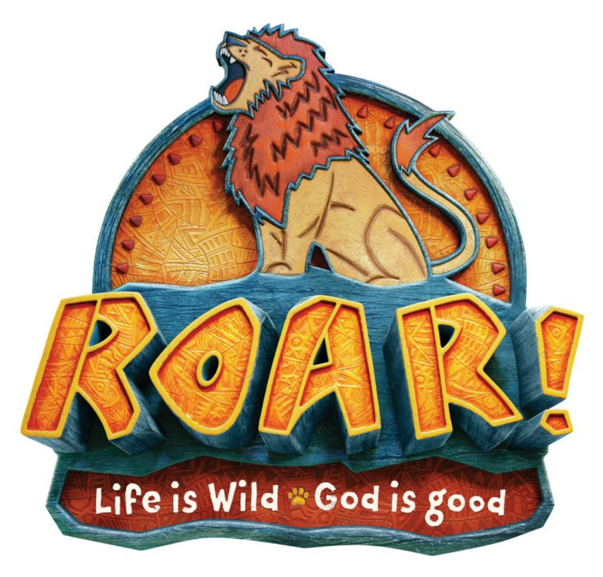
Vacation Bible School June 23<sup>rd</sup>—27<sup>th</sup> 5:00 p.m.—8:00 p.m.