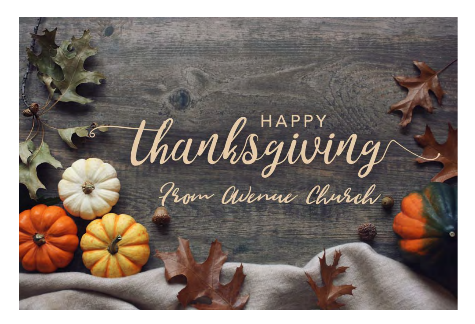
Wednesday, November 27, 2019