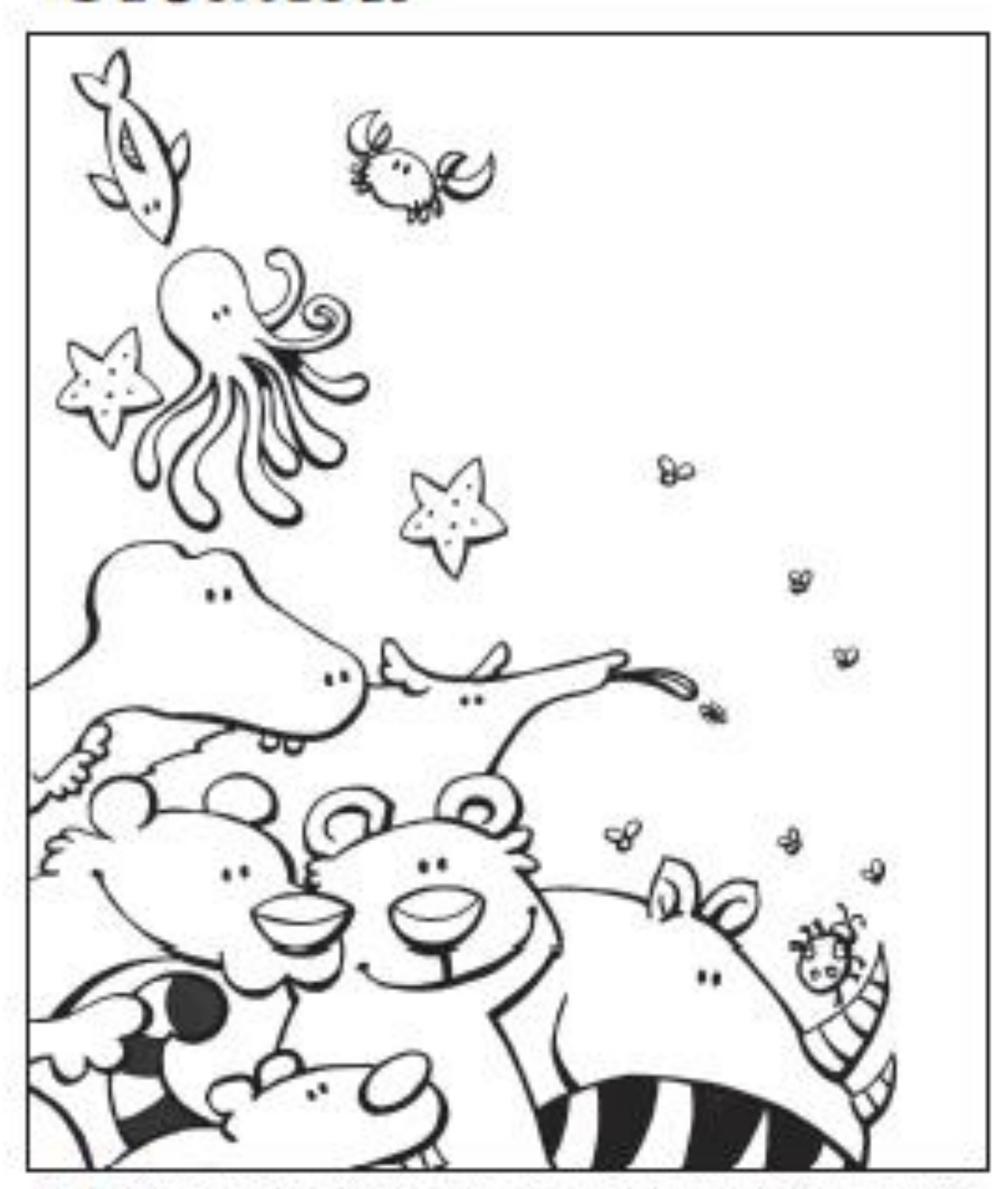
On the sixth day, God said, "Let there be animals of every kind on earth!"