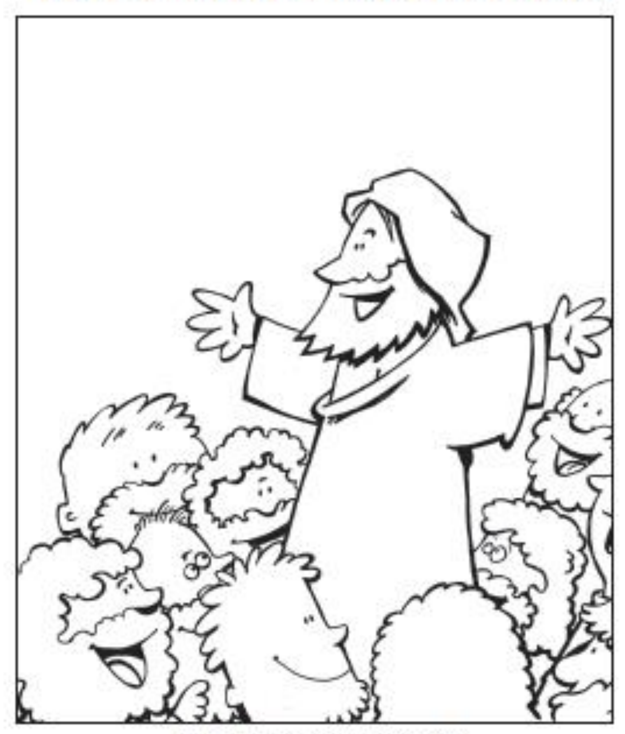
Jesus smiled. "Peace be with you!"