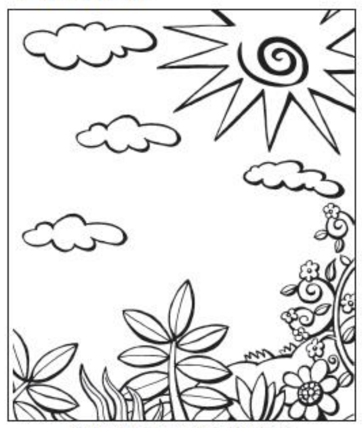
God saw that the plants and trees were good.