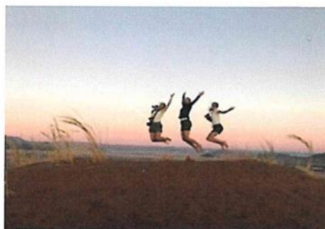
Spain Pecometh Camp Scholarship