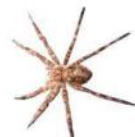
Dark Fishing Spider