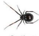
Southern Black Widow