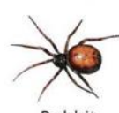
Rabbit Hutch Spider