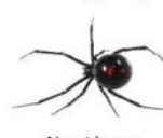
Northern Black Widow